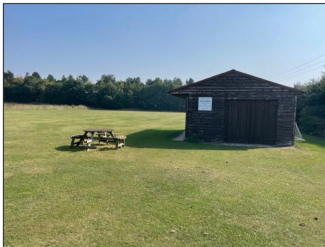
General view from entrance; pavilion, picnic bench and woodland boundary to east