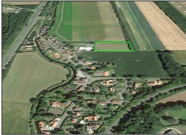
Aerial view showing relationship with Ranby village and the school (white buildings to left)