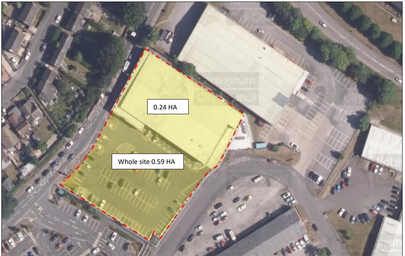
Askern Rd, Bentley, Doncaster DN5 0EW (Ratio – 1:2)