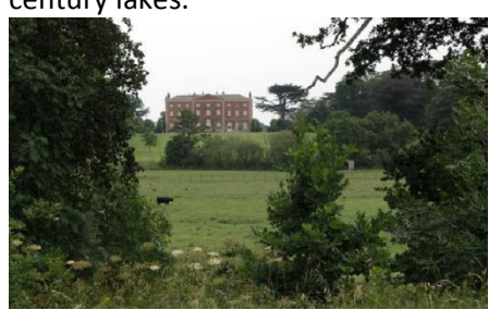
Serlby Hall and parkland

Large park with wide range of buildings and landscape features; Earliest feature probably the 'Roman Bank' (medieval in date); Serlby Hall (grade I); range of outbuildings including stables, walls and other garden features, all listed (grade II); other unlisted buildings regarded as non-designated heritage assets; lodges along entrances, mostly grade II listed; wooded plantations (including large wood to west of hall), naturalistic lake to north of house, tree-lined roadways including a beech avenue, large south lawn, specimen trees, duck decoy, c1906 golf course, large 20<sup>th</sup> century lakes.