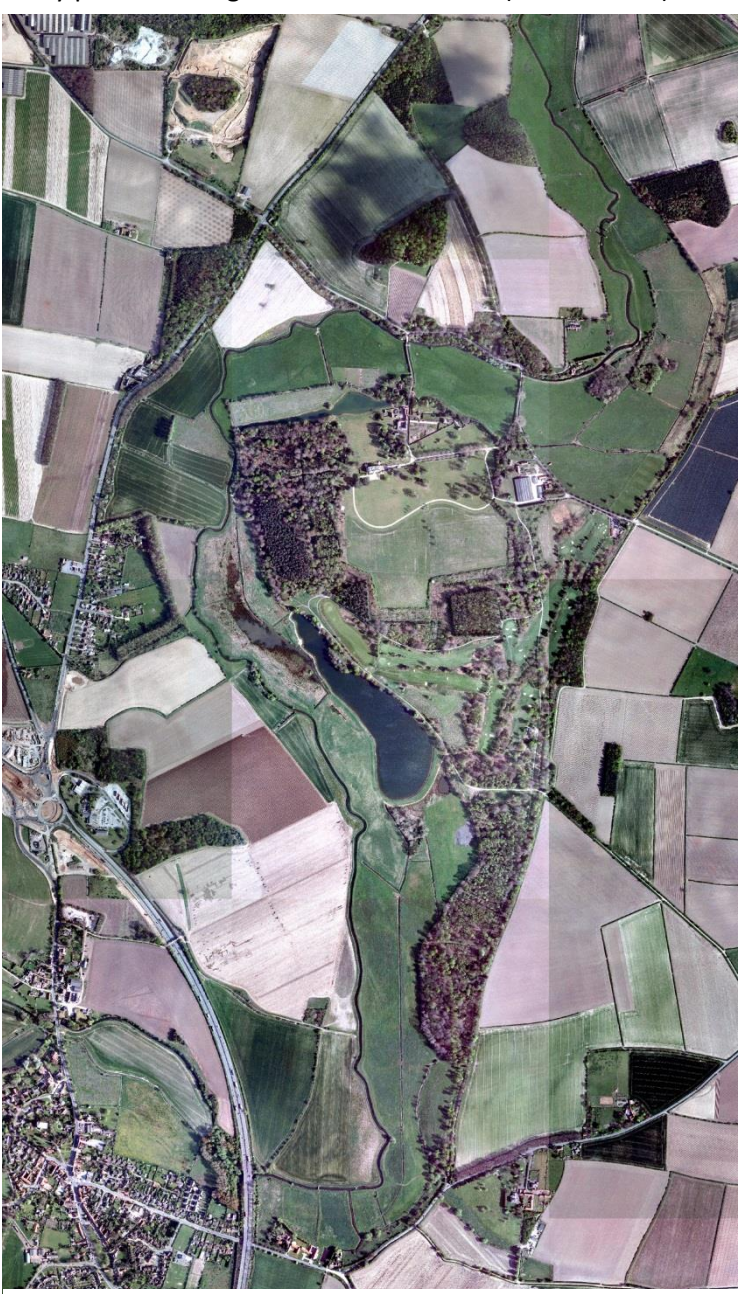
Aerial photograph of Serlby, taken 2007