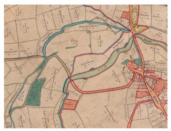
1782 – Map of Part of the Parish of Blyth