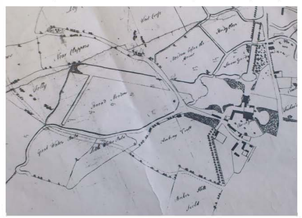
1758 – A Plan of Mr Mellish' House and ground adjoining at Blythe in the County of Nottingham

Primarily 17<sup>th</sup> and 18<sup>th</sup> century landscaped park with 19<sup>th</sup> century alterations, formerly associated