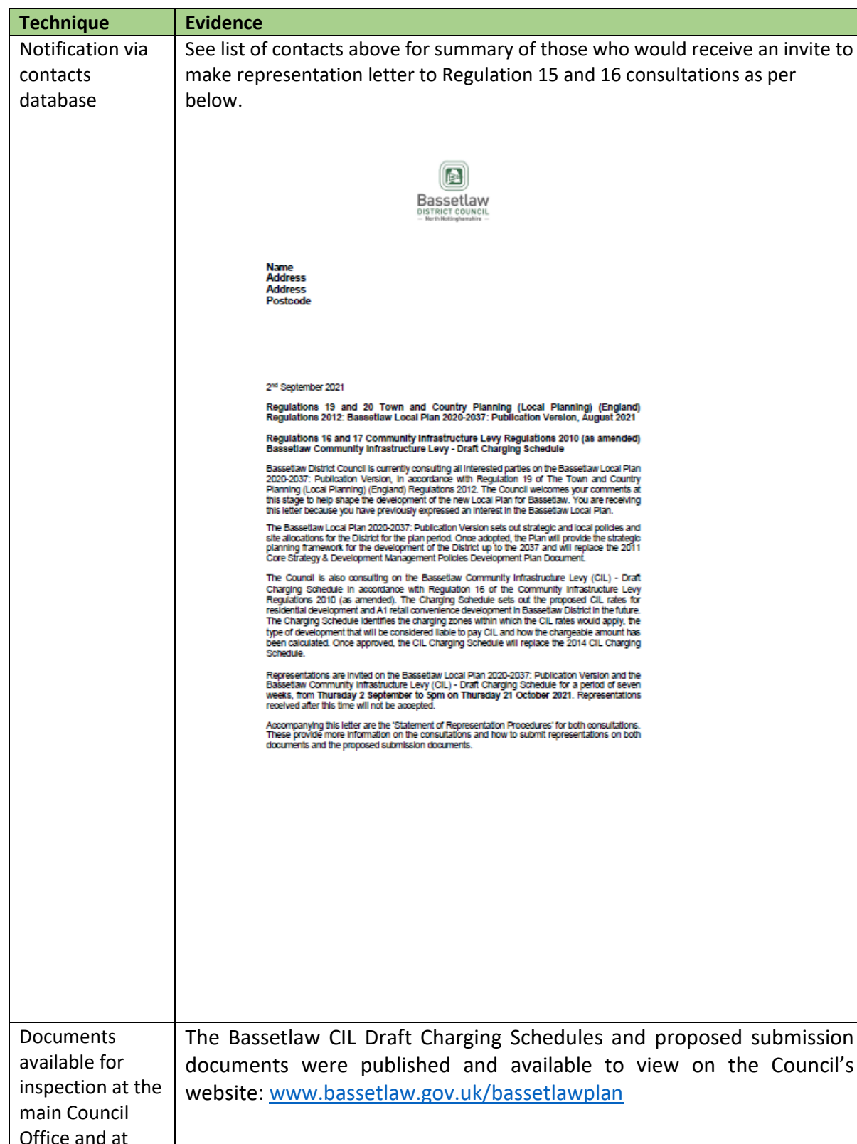
Table 3: Consultation Techniques – Examples of approaches used during the Regulation 15 and 16 consultation periods.