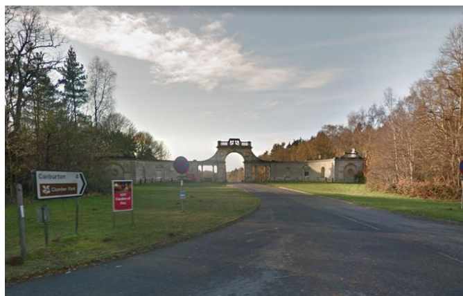
Figure 5.1: Entrance gate to Lime Tree Avenue, as viewed from A614 38

5.30 Overall, the Local Plan is not expected to lead to habitat change at this site as a result of air pollution from increased traffic on the A614. In addition, the potentially affected area of habitat is small, and makes up a very small part of the overall ppSPA, particularly when considering only the fragment of habitat that is within 200m of the A614. There is a large area of suitable foraging habitat in the wider area and as such, in the unlikely event that this small fragment of habitat was affected, it would not result in adverse effects on the integrity of the ppSPA as a whole.