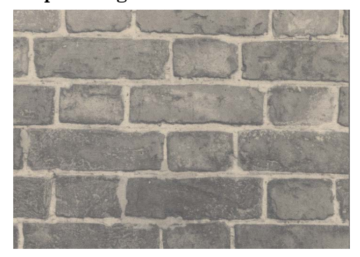
Good repointing of brickwork.

1. Joints should be carefully raked out to a depth at least equal to the width of the joint and, generally to a depth of not less than 40mm (just under 2 inches) in rubble stonework & 20mm (just under 1 inch) in brickwork (and fine ashlar stonework).