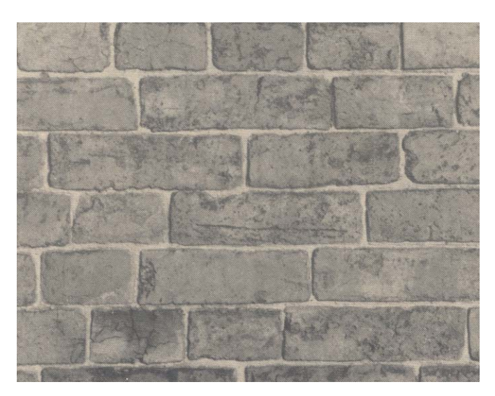
Old pointing which is sound and doesn't need repointing.

Historic buildings were built in lime mortar which is flexible and permeable, and allows the building to 'breath'. Lime mortar must always be used and repointing carried out carefully.