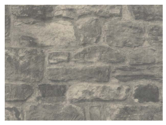
Good repointing of stonework.