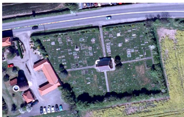
Aerial photograph of Gringley Cemetery, taken 2007

War Memorial (grade II listed), mortuary chapel, various styles of gravestones and monuments, semi-mature trees, boundary hedges.