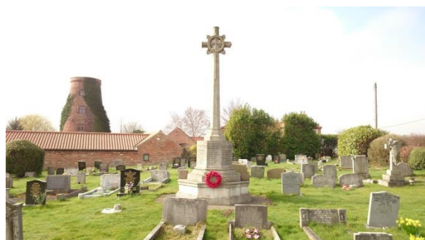
Gringley on the Hill War Memorial (grade II listed)