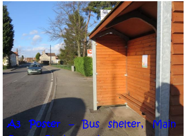
A3 Poster – Bus shelter, Main Street, Clarborough