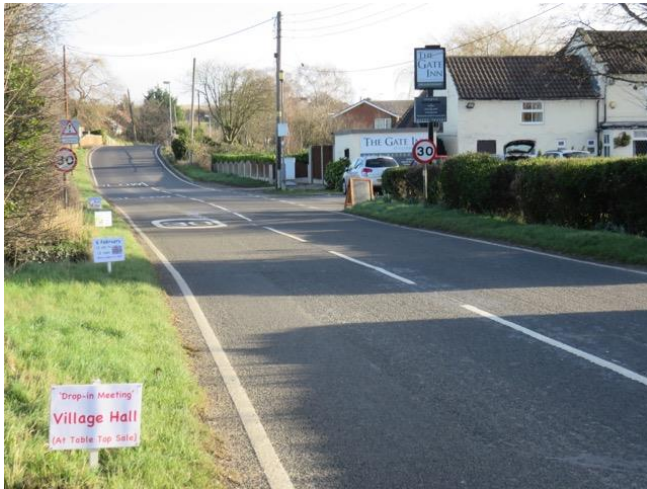
Roadside A3 Posters – Smeath Lane, Clarborough