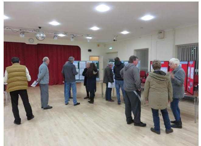
'Drop-in' Meeting – Village Hall, Clarborough