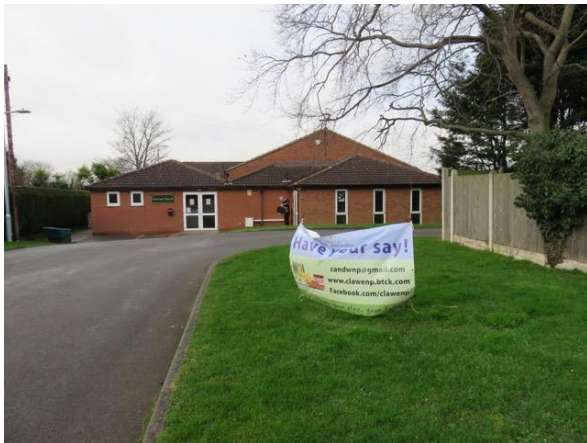
Large Banner – Village Hall drive, Main Street, Clarborough