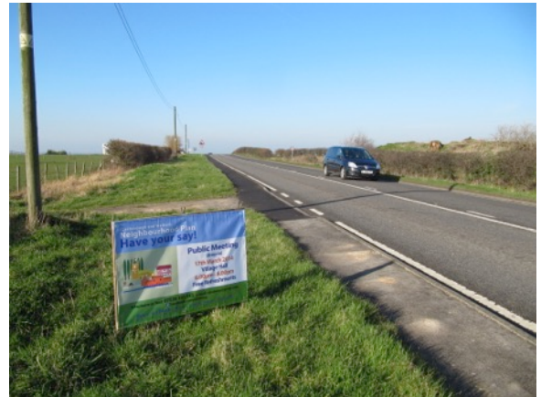
Roadside Banner Using 'house style', 2 of these were used in several locations in the Parish.