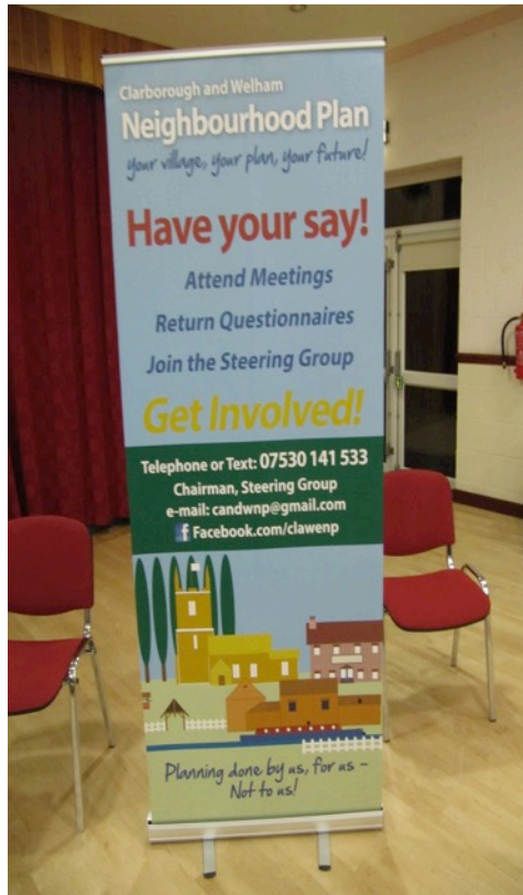
Roller Banner Used at events and during interim periods to maintain a 'presence' in pubs etc