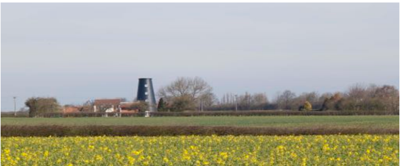
From B1164 towards Priestgate and old windmill