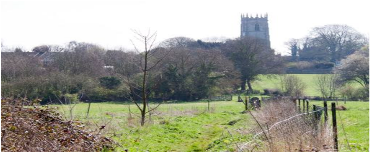
Footpath from Mark Lane to the Church