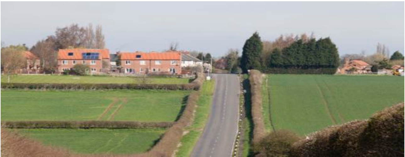
From Tuxford Road towards Crossroads