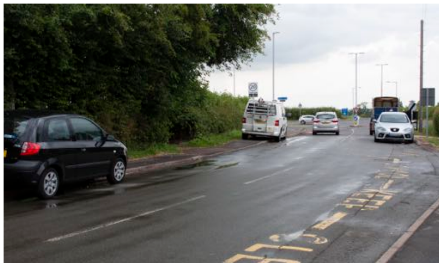
Askham Road/A57 Crossroads