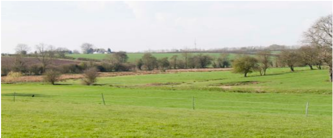
From near Manor Cottage