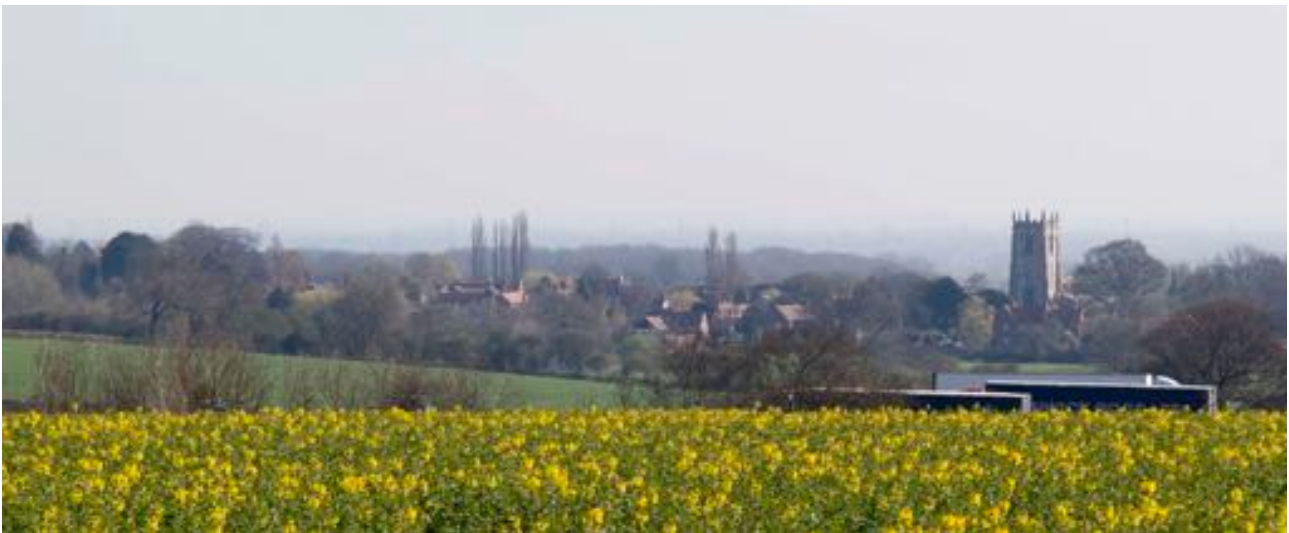
From B1164 across A1 towards village