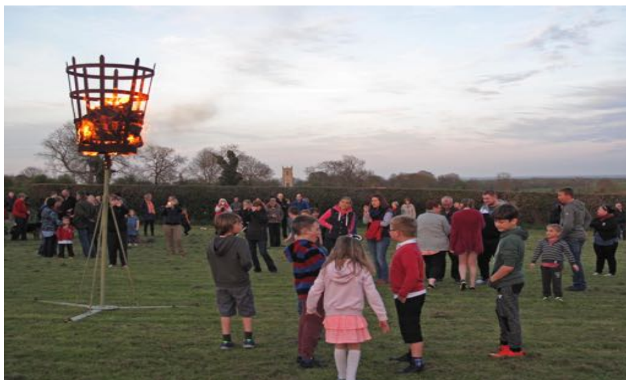
The Queen's 90th Birthday Beacon