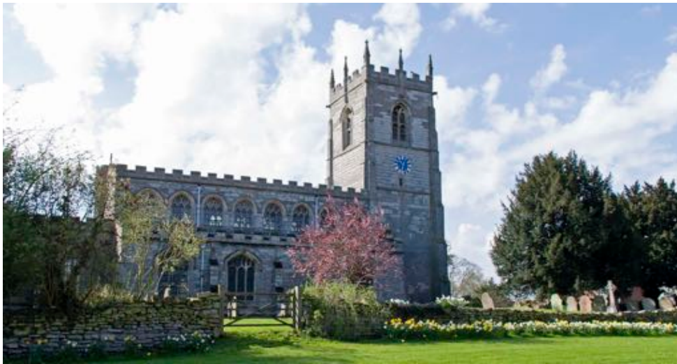
St John the Baptist