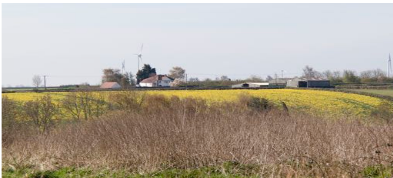
From High Street towards Priestgate