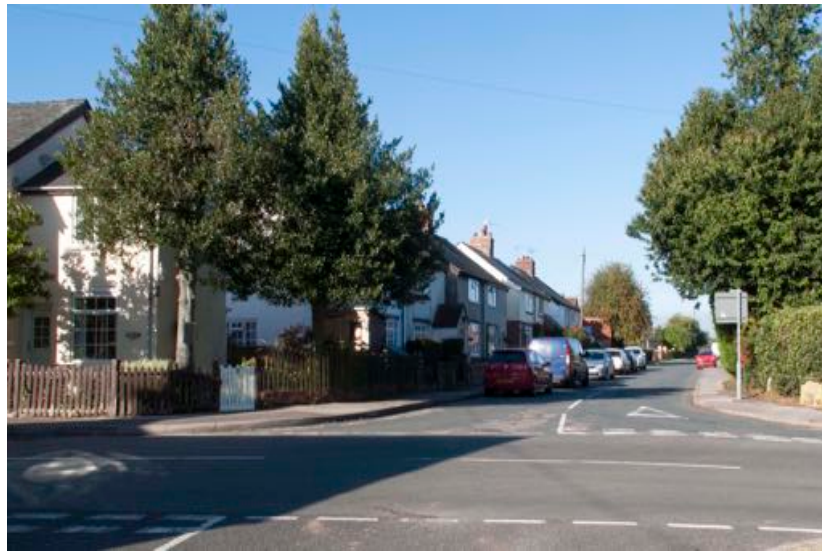
Priestgate/Beckland Hill Crossroads