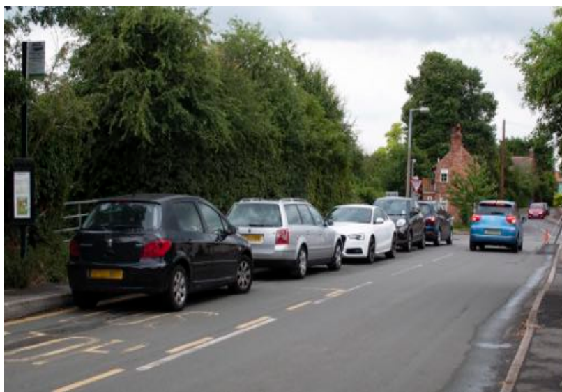
Askham Road towards High Street