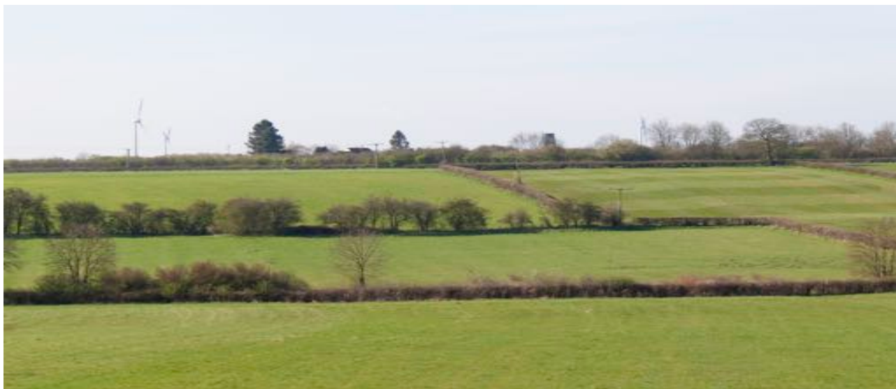
From High Street towards Priestgate and old windmill