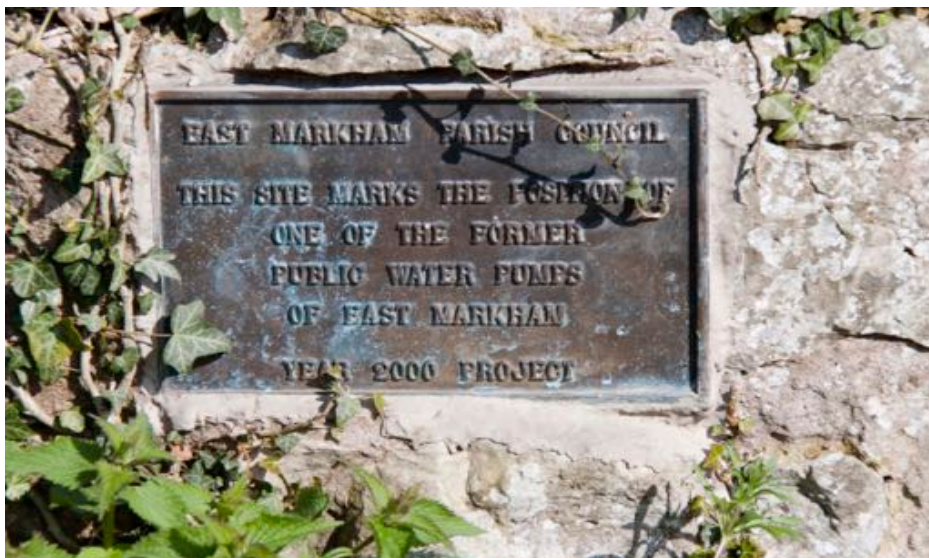
Old Village Pump Site Mark Lane