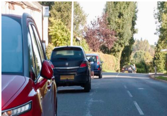
Tuxford Rd/ Beckland Hill Crossroads