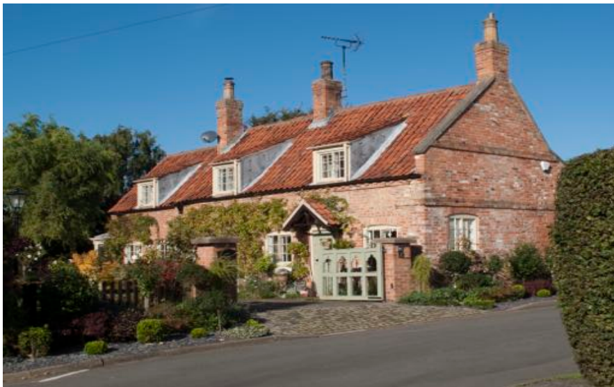
Cottage, Church Street