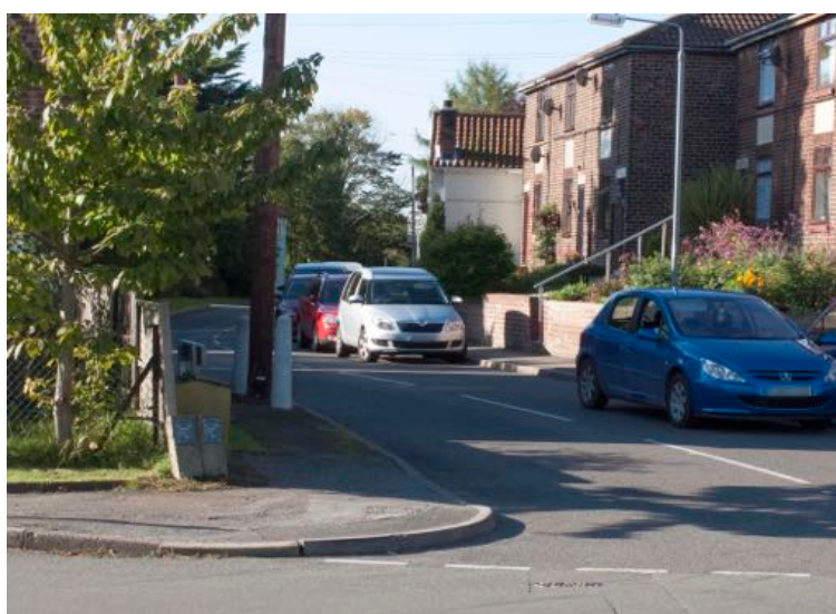
Farm Lane /High Street Junction