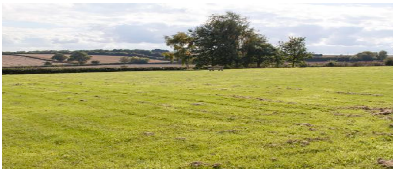
From Parish Field Tuxford Road