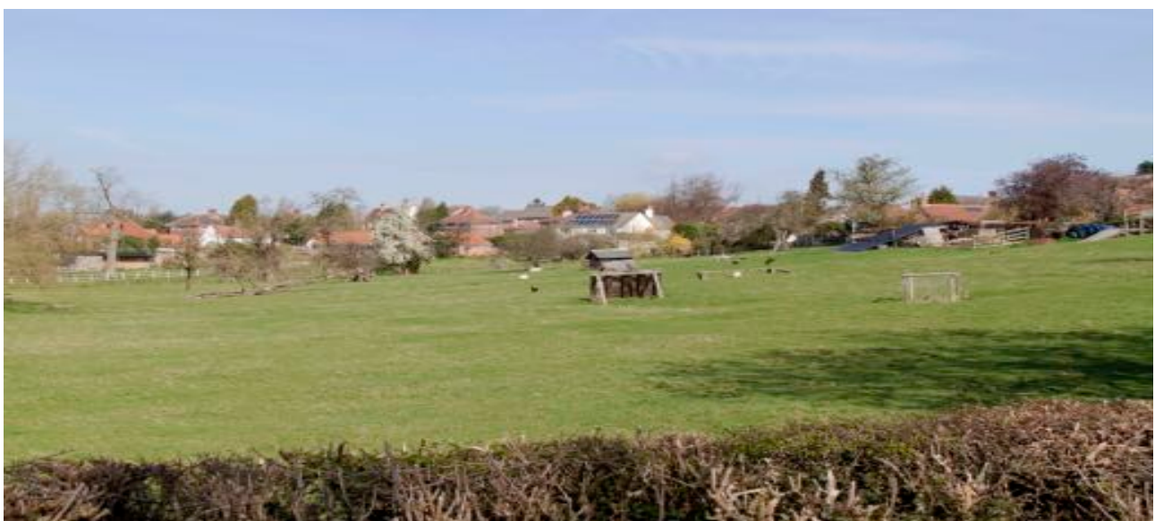
From Mark Lane towards Low Street