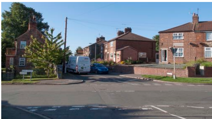
Farm Lane/High Street Crossroads