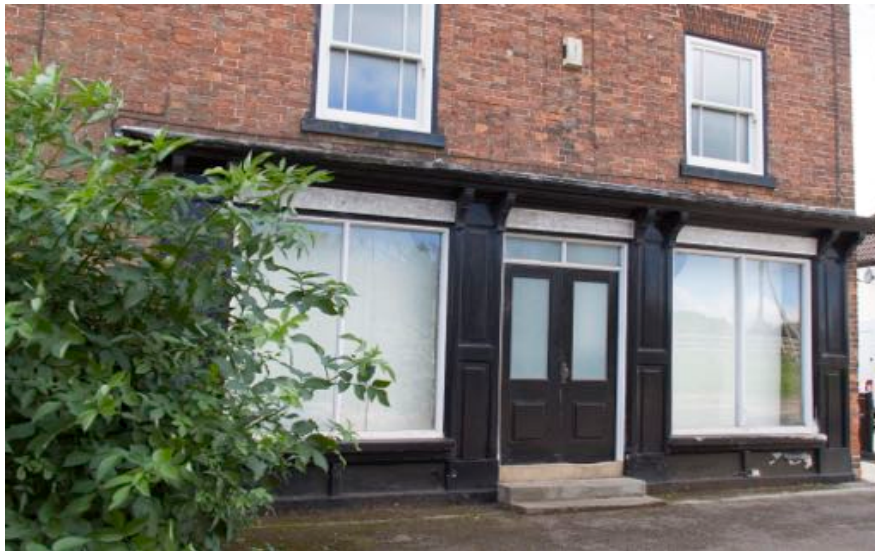
Former Village Shop