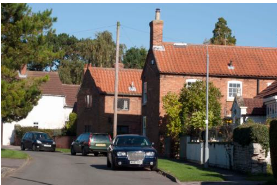
Typical "End to Road" Houses