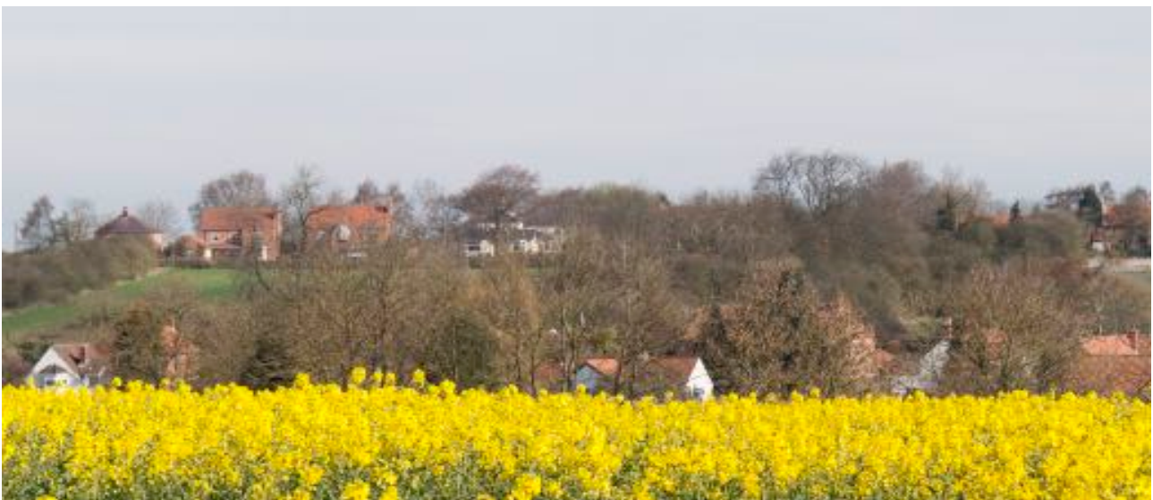
From Priestgate across York Street to High Street