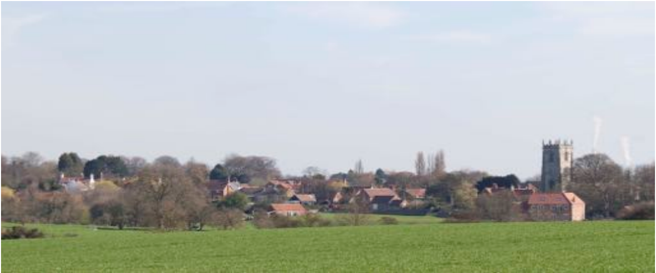
From Tuxford Road towards Church