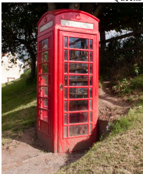
Telephone Box Book Exchange