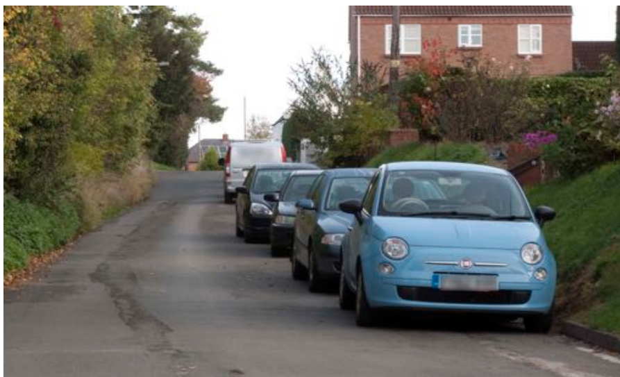
Old Hall Lane