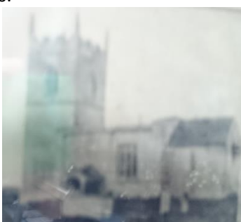
1880s photo of South Wheatley Church