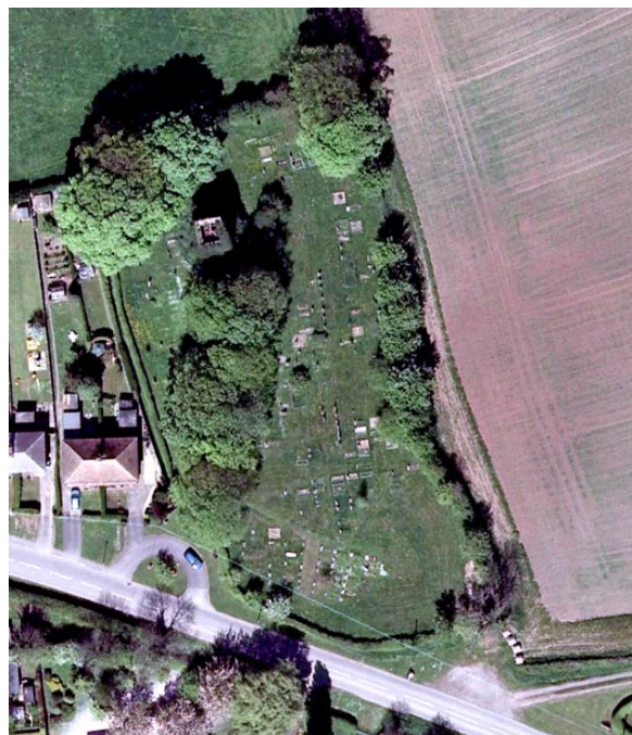
Aerial photograph of South Wheatley Churchyard, taken 2007

Remains of west tower and a chancel arch (grade I listed and scheduled), near-rectangular shape with diagonal southern boundary following Roman road, boundary hedges, trees, numerous historic gravestone and memorials.