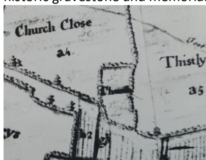
1753 South Wheatley Enclosure Map