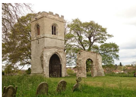
View of remains of South Wheatley Church (Scheduled Ancient Monument and grade I listed)