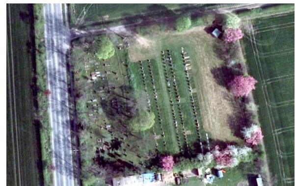
Aerial photograph of Ranskill Cemetery, taken 2007

Timber entrance gates with rustic timber gateposts. Hawthorn boundary hedge and numerous mature sycamore trees. Various gravestones and monuments including 2 military graves.