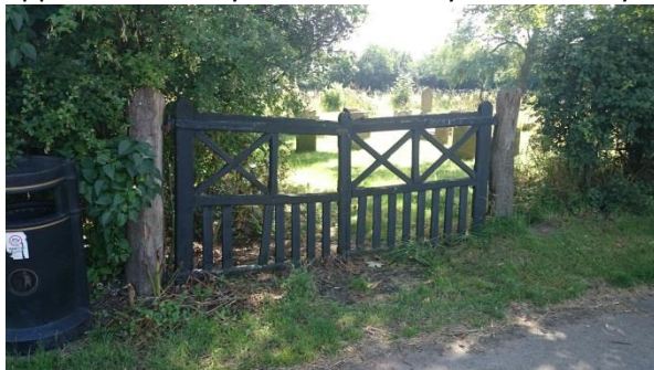
Original main entrance

Small rectangular municipal cemetery south of Ranskill, with late-20 th century extension (not included). Surrounded primarily by hawthorn hedges and sycamore trees, with original entrance (at north west corner) comprising a pair of timber gates with rustic timber gate posts. Earliest burial appears to be July 1886. Cemetery has a variety of significant gravestones and monuments.