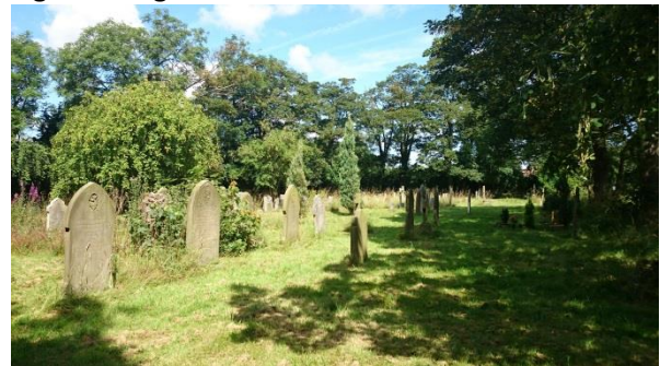
View of c1886 part of cemetery