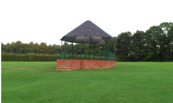
1946 band stand, recently restored