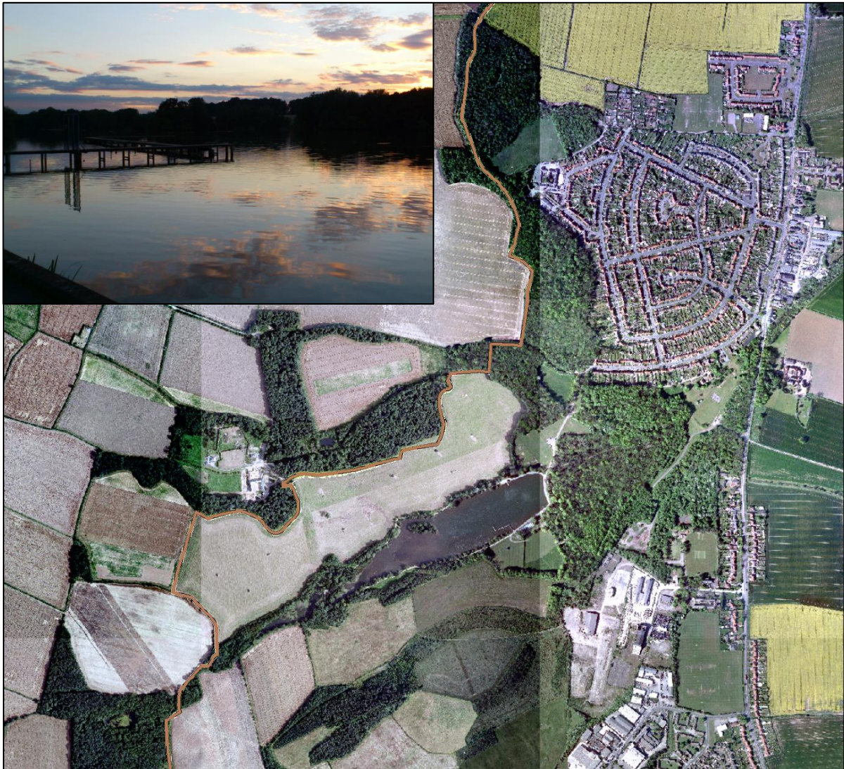
Aerial photograph of Langold Park, taken 2007 with inset photo of pontoon on the main lake.

Large inter-connected lakes, dry lake, weirs, bridge with boathouse underneath, bandstand, pontoon, large areas of planted woodland with footpaths throughout, dry lake, remains of colliery railway, 81m high spoil tip.