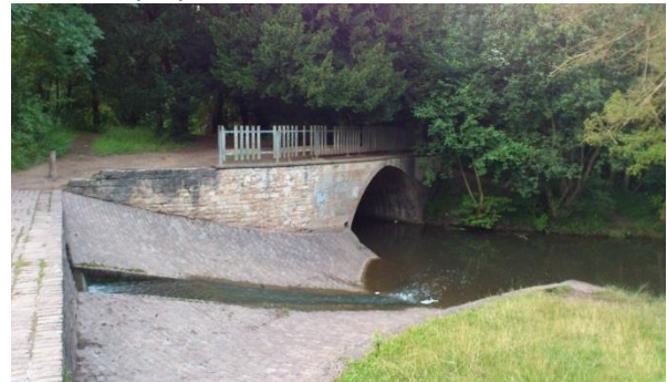
Bridge with 19 th century boat house underneath