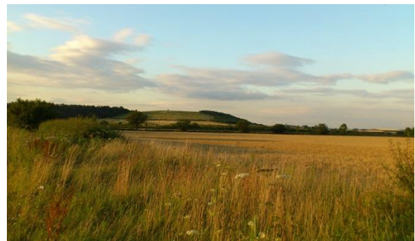
View of pit hill from south