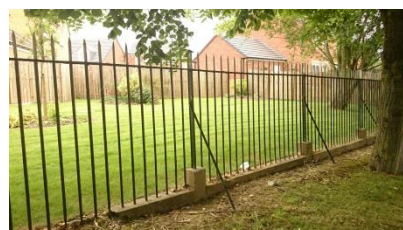
Railings along north west boundary