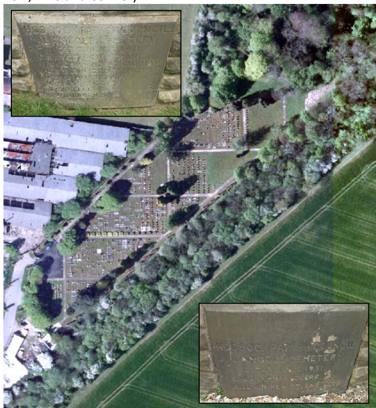
Aerial photograph of Langold Cemetery, taken 2007, with inset photos of dedication stones at entrance.

Cemetery opened in 1931, relatively narrow site between Cemetery Road and the former mineral railway for the nearby colliery. Site is surrounded by iron railings set into a low concrete wall foundation. Main entrance has rusticated stone wall with railings, iron gates and hollow iron pillars. interior of site has tree-lined walk around the outside with paths crossing the site in a grid pattern. several iron braziers and an iron-framed sign exist along the north-west part of the site. Cemetery contains a range of significant gravestones and monuments and a variety of mature trees (including Yew, Pine and Conifer).