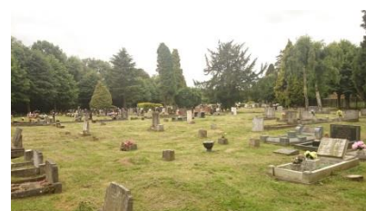
View across cemetery from north