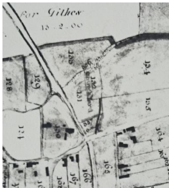
1795 N. Leverton & Habblesthorpe Enclosure Map