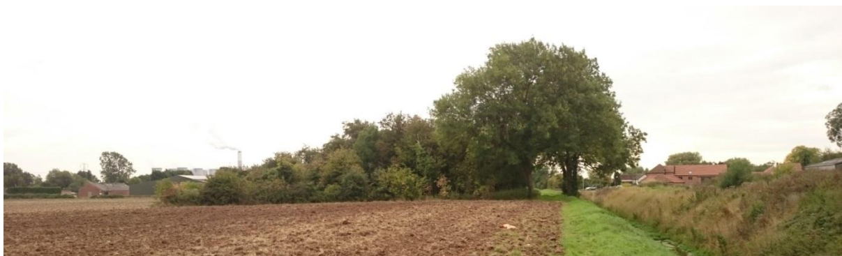
View of churchyard from north