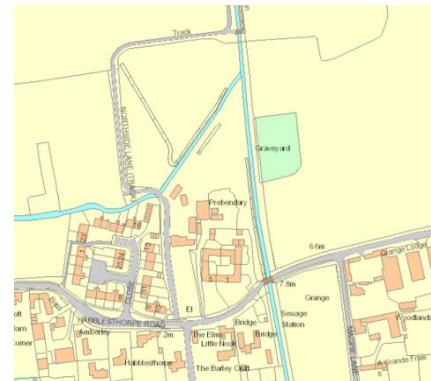
2015 O.S. Map showing churchyard