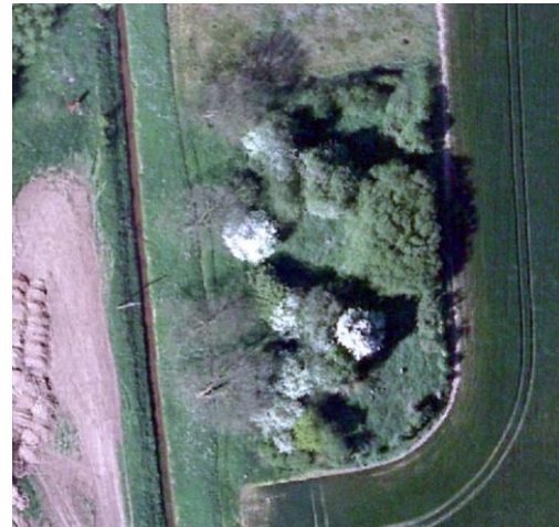
Aerial photograph of Habblesthorpe Churchyard, taken 2007

The medieval church was dedicated to St Peter and was in ruins by the early-18 th century. The two separate parishes of North Leverton & Habblesthorpe were united on 25 th March 1884 i . The landscape around the churchyard was altered in the 1770s when the Catchwater Drain was excavated (finished May 1772) and the footpaths and field boundaries around the site were straightened (see comparison between 1795 and 1898 maps – the 1795 map is based on a pre-Catchwater Drain land survey so shows the original layout). St Peter's Churchyard was still used for burials until 1912 ii . The site is primarily overgrown with trees, bushes and brambles, although gravestones are still visible throughout.