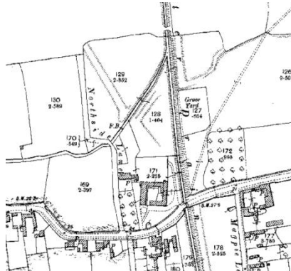
1899 O. S. Map showing churchyard with later drainage works to west.