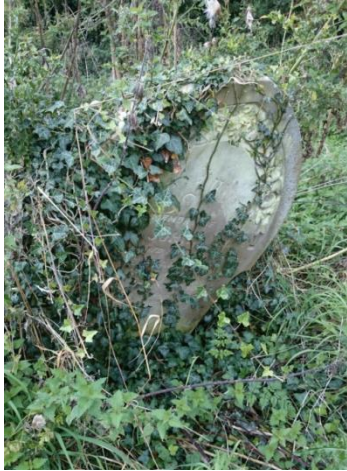
Gravestone dated 1901

Range of gravestones and monuments ranging from the 18 th century to 1912. The churchyard is slightly elevated compared to the surrounding land. A trackway runs to the west of site and various earthworks (earlier roadways) are visible adjacent to the site, especially to the west and north.