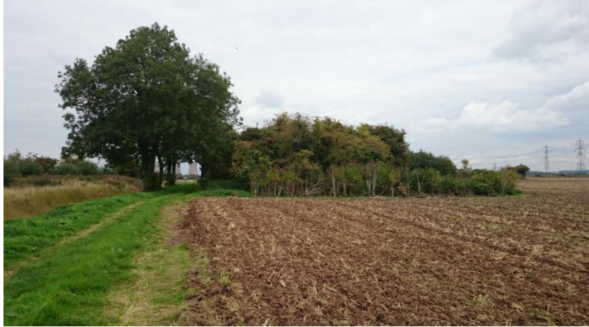
View of churchyard from south