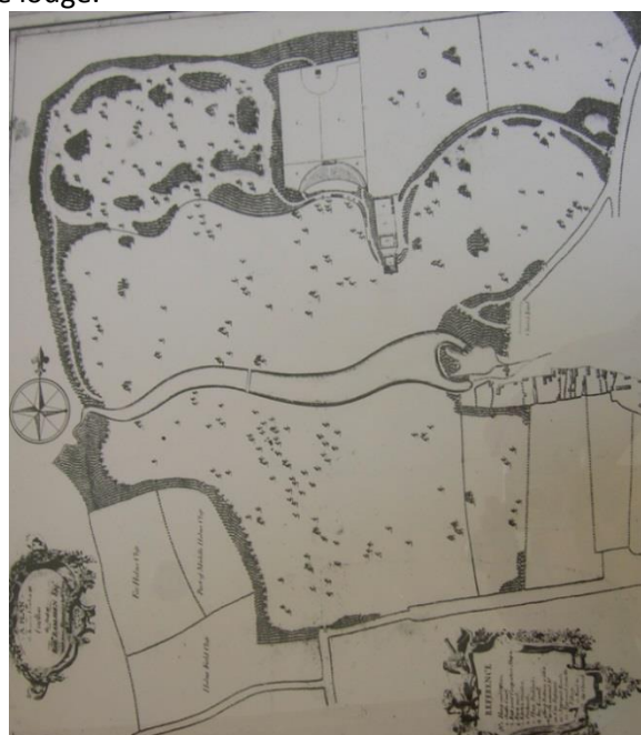
1783 – 'A Plan of the demesne lands at Carlton, the seat of Rob Ramsden Esqr, with some alterations by Wm Emes'

Surviving elements of the 17 th century park include Carlton Wood (although most larger trees date to the 18 th and 19 th centuries), Carlton Lake (although later altered), various footpaths and a series of archaeological features visible within later landscaping. The present park is largely the result of the