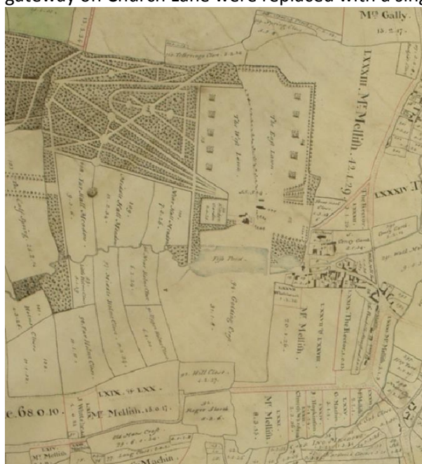
1769 – Carlton in Lindrick Enclosure Map

17 th & 18 th century landscaped park formerly associated with Carlton Hall (demolished in 1955). The original Carlton Hall was constructed in the early-17 th century as a hunting lodge for Sir Gervase Clifton, 1 st Baronet i . That original park included Carlton Wood, together with a series of regular wooded enclosures and a large lake (see 1769 map below). The estate was sold to the Mellish family (of Hodsock and Blyth) in 1765 and was sold again to the Ramsden family in c1774. Robert Ramsden Esq had the park extensively remodelled in 1783, to designs by noted landscape architect William Emes ii (previously head gardener at Kedleston). The William Emes alterations included the serpentine lake, the circular field with curved belt of trees, the kitchen garden (including the ha-ha and listed wall) and a range of ancillary buildings (now converted to residences). In the 19 th century, the present Ramsden Primary School was erected (in 1831) and two small lodges either side of a gateway on Church Lane were replaced with a single lodge.