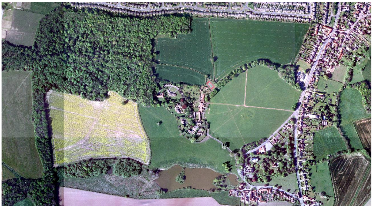
Aerial photograph of Carlton Hall, taken 2007