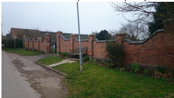
Front boundary wall