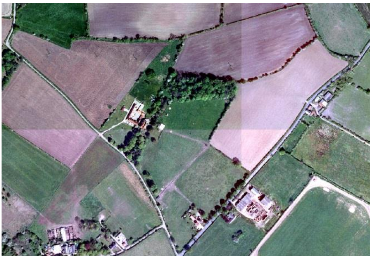
Aerial photograph of Bolham Hall, taken 2007