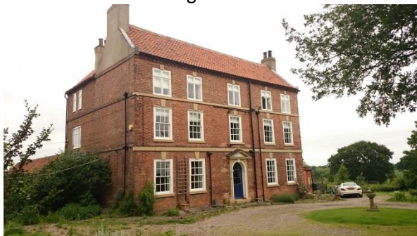
Bolham Hall Farmhouse

Large farmhouse (grade II listed) with detached barn range, lawned areas, individual specimen trees, belts of trees and hedge boundaries.