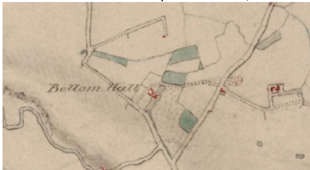
Extract from 1820 Map of Nottinghamshire

Large mid-18 th century farmhouse set within large grounds, mostly paddocks (originally open lawns) but with some individual specimen trees, belts of trees and hedge boundaries.