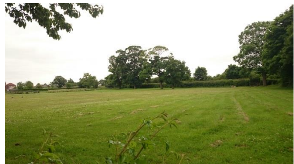
View of parkland to east (now paddocks)