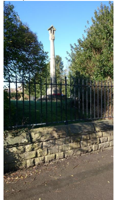
Front boundary wall and railings with War Memorial behind