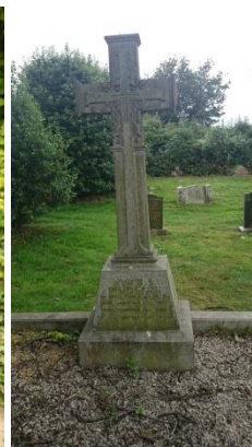
Grave of Lord Barnby