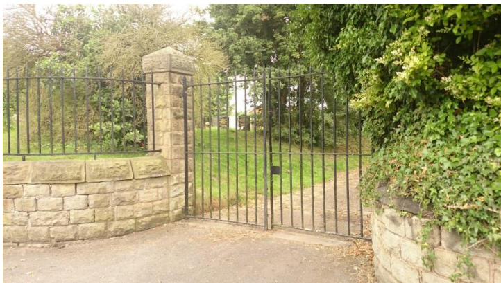
Entrance gates, gate piers, boundary wall and railings