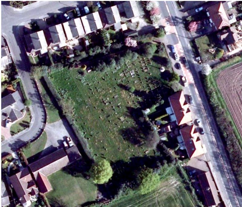
Aerial photograph of Blyth Cemetery, taken 2007