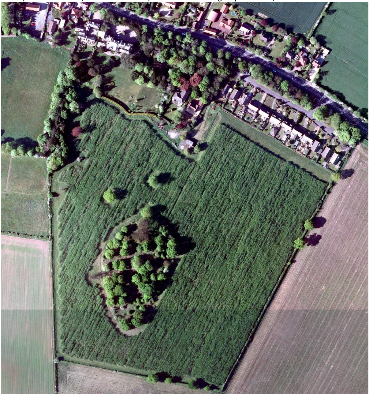
Aerial photograph of Barnby Moor House (now Hall), taken 2007

Barnby Moor Hall (was Barnby Moor House); Coach House and stable range to rear; Boundary walls; Small parkland to rear; Various mature specimen trees and groups of trees; Remains of ice house.