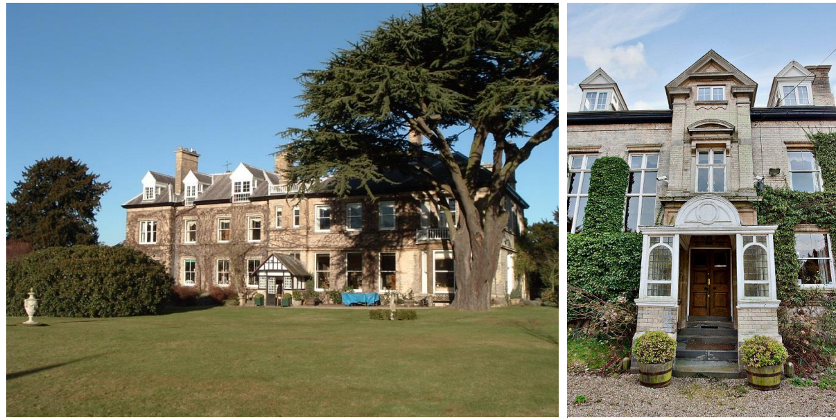
Rear elevation, 2006