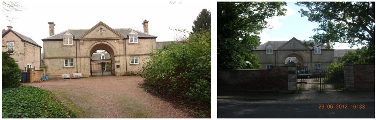
Façade of Coach house

To the west of the house is a detached coach house and stables (part of the stables is probably early-19<sup>th</sup> century) earlier. The large arch through the coach house is one of the most notable parts of the site.